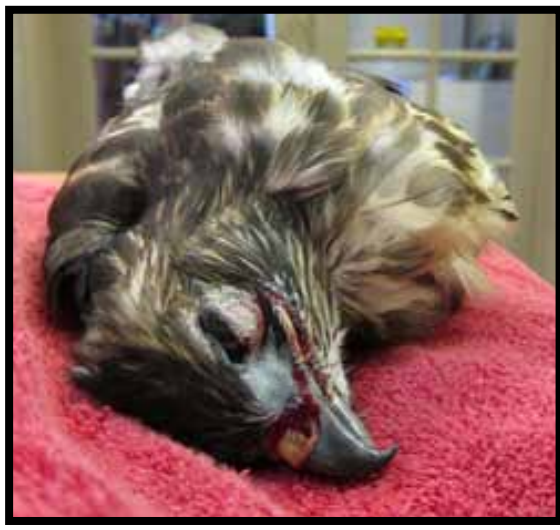
Hawk killed by rodenticides in its system.

Do your own research by looking up the Material Data Sheets for the active ingredient in any pesticide or rodenticide you might be inclined to use. Throughout California, the use of poison baits such as d-Con, are responsible for killing wild animals and pets. This is because pets , as well as predatory or scavenging birds and mammals including owls, eagles, hawks, falcons, and vultures, raccoons, foxes, skunks, ringtails, minks, bobcats and fishers would eat poisoned rodents and so are also be poisoned.