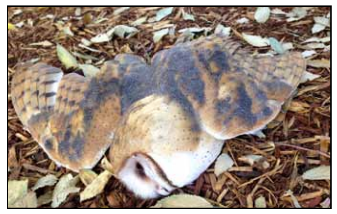
Owl killed by rodenticide.

Rodenticides can be counterproductive to rodent control by poisoning, harming, and killing natural predators that help regulate rodent populations throughout California.